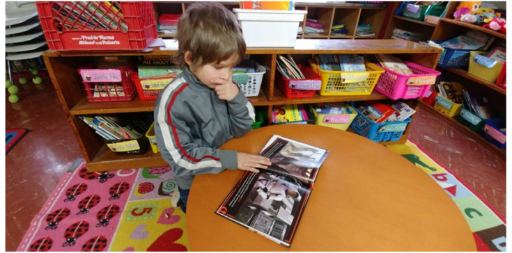
We love to read around the room during Read to Self. ☺

View the color photo and more photos in the online issue of our newsletter and on our school website at http://www.henrycountyr1.k12.mo.us/ .